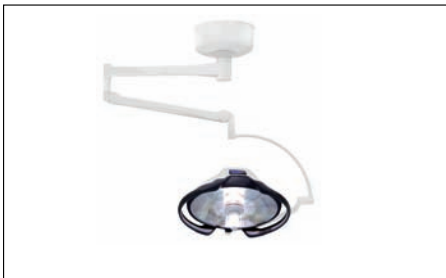
MODEL DUO HALOGEN X1