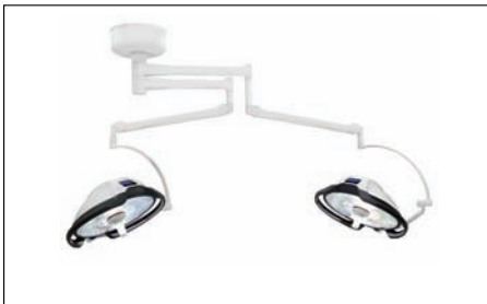
MODEL DUO HALOGEN X2