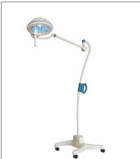
MODEL CL-4M / CL-4MB