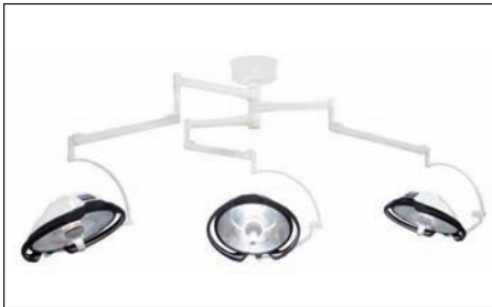
MODEL DUO HALOGEN X3